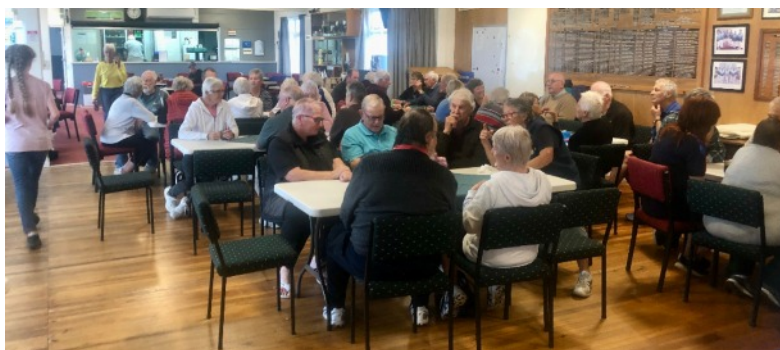
Happily back in the clubrooms out of the rain