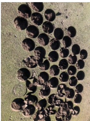
Gone to Manakau

The old Astrograss surrounds of the green and the material from the ditches have all gone and there is a gaping hole in the north fence to allow access for the heavy machinery. Soon activity will ramp up and I will send out regular updates with photos of the various stages of the work for those who don't get down to the club regularly. With suitable weather and no long delays the new green could be in use by July.