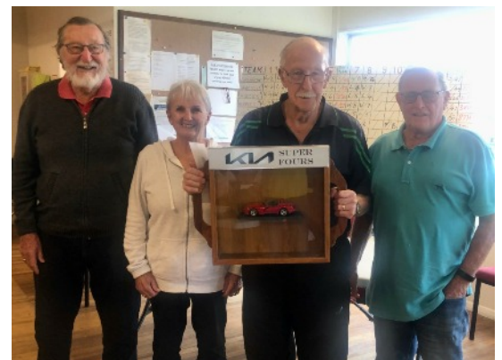
The winning team with the Kia Motors Super Fours trophy