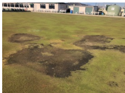
Goodbye brown patches