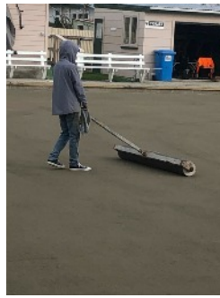
Hand levelling work to be done