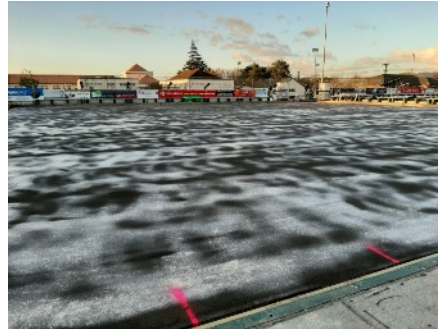
Total coverage now