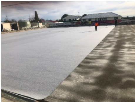
Most of the underlay is down ready for the carpet to be laid