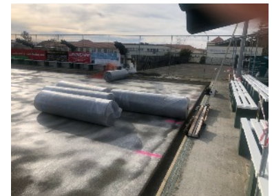
Rolls of waiting underlay