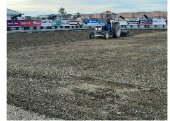
The soil has gone, the base course is complete and levelling and rolling continues.