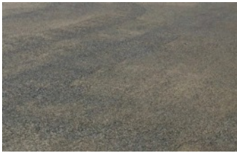
The final layer of sand is laid and levelled.