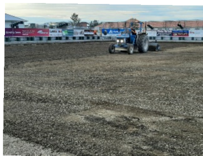
More material is added and levelled

Much of the network of drains has been laid and large piles of gravel are in place ready to be spread to create the next layer of the base.