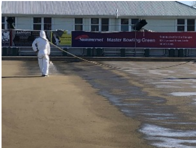
Spraying on the adhesive mix