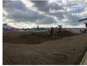
Not much green left now. Gone tomorrow?