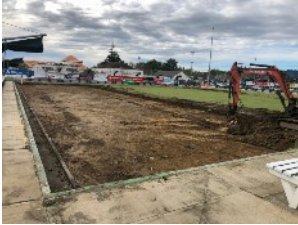
A couple of rinks gone already.