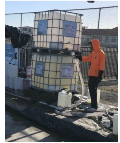
Mixing the adhesive brew for spraying on the levelled surface