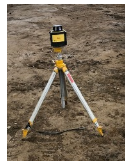
The laser level