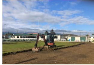
A day of rest for the digger but about half the green gone now.