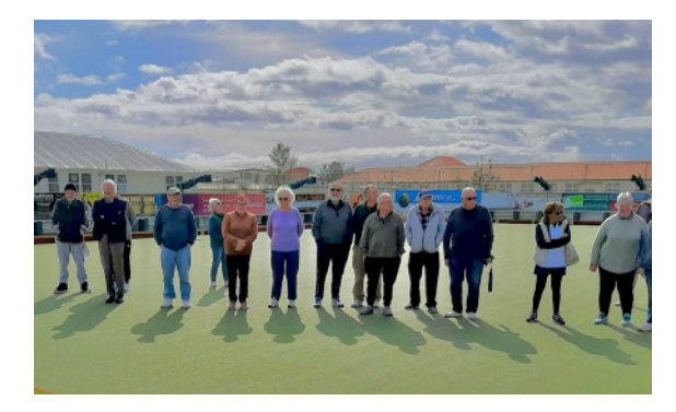
Some of our members at the opening