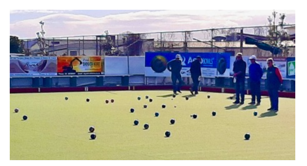
The first roll up on the new green - not all the bowls made it too close to the jack on the first end.