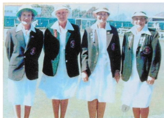
The 1980 Fours team