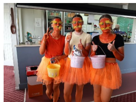
Not sure who the ladies are. They were in the club at Halloween and add a wee bit of colour to the front page.

We have a pretty strong men's Premier I team as well though the powerful Paekakariki team will be favoured to be repeat winners. It looks as if there will be byes in most divisions as there are uneven team numbers which is a shame for all the players involved. Falling membership of clubs make this inevitable.