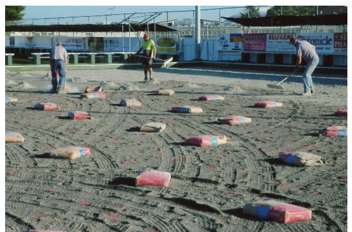
Placing 250 bags of cement