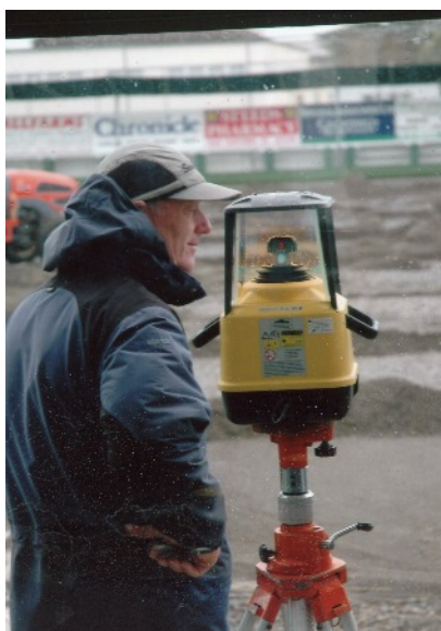
The laser leveller on the bank was linked to the receiver on the tractor.