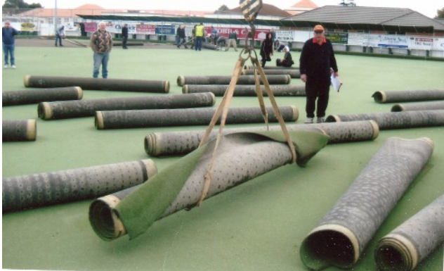
Taking up rolls of Astrograss