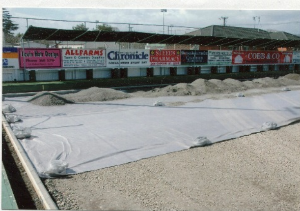
Laying the GeoText membrane