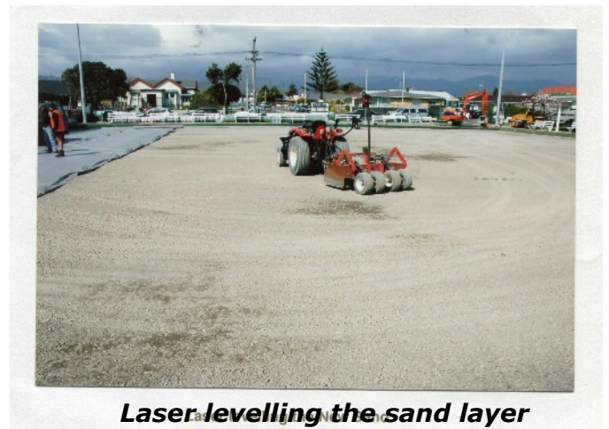
Laser levelling the sand layer