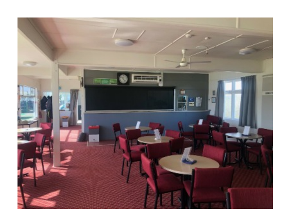
Ready for the Big Event