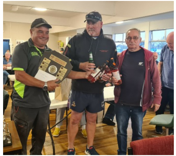
Cobb & Co. Shield winners