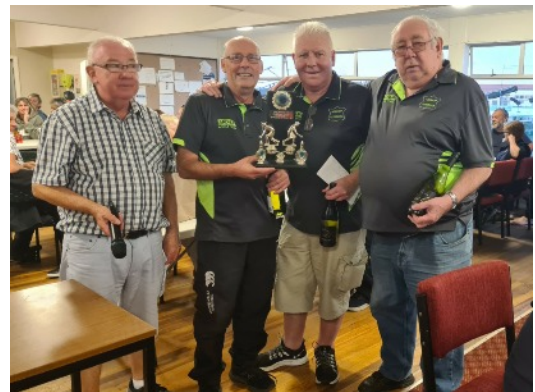
New World Trophy winners